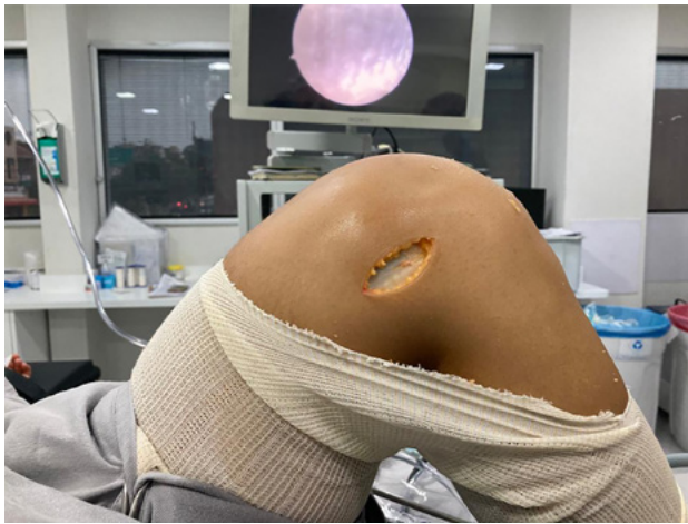
Figure 1: Lateral access to right knee.