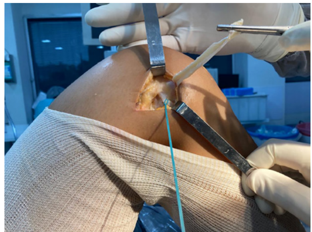
Figure 4: Lateral collateral ligament repaired with suture wire after its identification, and iliotibial tract repaired by forceps away from the surgical field for better visualization.

After harvesting the graft to be used in ACL reconstruction, arthroscopy of the knee is performed to identi-