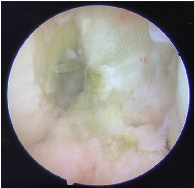
Figure 5: Arthroscopic view through medial portal of guide wire for creating shared tunnel at femoral anatomical point of anterior cruciate ligament.