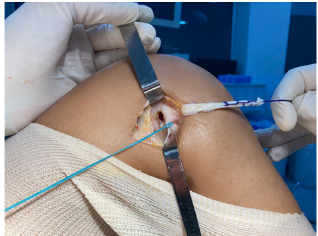
Figure 7: Shared tunnel created posterior and proximal to lateral epicondyle. Lateral collateral ligament repaired with suture wire, and iliotibial tract repaired with its suture for tenodesis.

The strip of iliotibial tract is passed underneath the