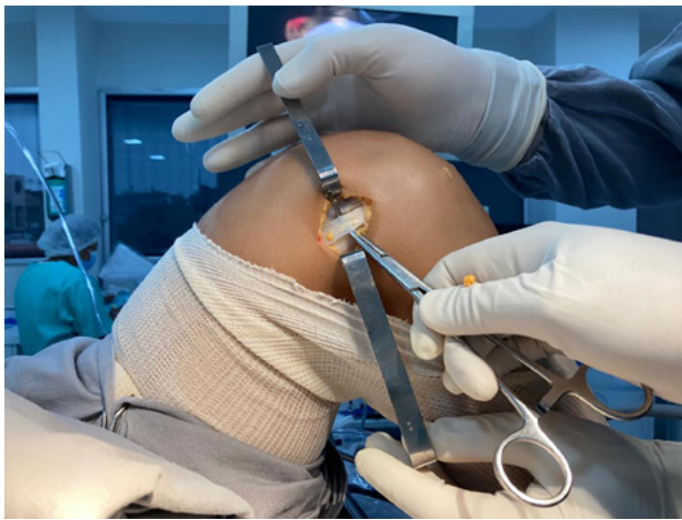
Figure 2: Dissection of iliotibial tract to be used in lateral extra-articular tenodesis of the knee.