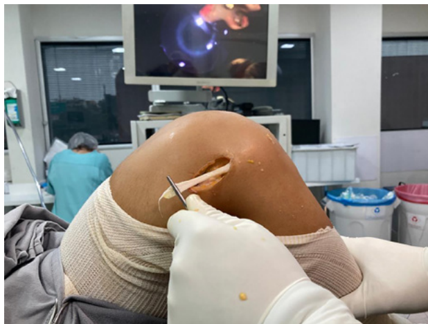
Figure 3: Dissection of iliotibial tract to be used in lateral extra-articular tenodesis of the knee, with detachment of its proximal portion.

Routine preparation for orthopedic surgery is carried out.